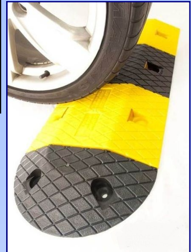
Poly-Ethylene Speed Hump