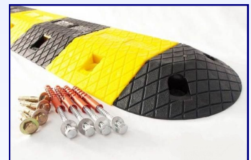
Fixings Included for either concrete or asphalt