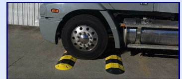
Suitable for use with Heavy-Vehicles and Construction Equipment